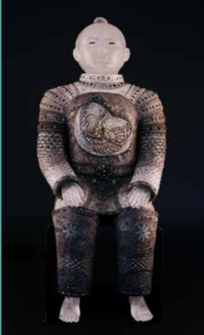
Vivian Wang Dragon Warrior 34 x 14 x 16 in Exhibition: Commentaries